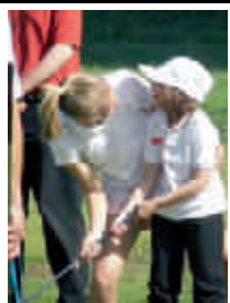
Images from the Don Fightmaster Golf Outing for Exceptional Children