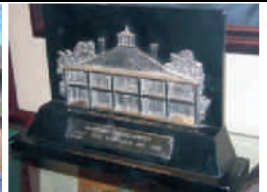
Golf House Kentucky is home to the Kentucky Golf Hall of Fame

Kentucky Golf Foundation Golf House Kentucky 1116 Elmore Just Drive Louisville, Kentucky 40245 (502) 243-8295 (800) 254-2742 (502) 243-9266 – Fax Visit us online at kygolf.org